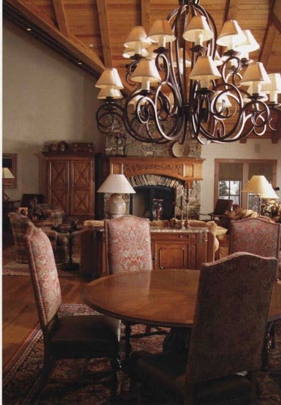
Dining in the round affords the best arrangement for conversation. This custom-designed table seats six in its usual configuration. With its unique quarter-round leaves in place, the still-round table seats ten in richly textured upholstered side chairs. A massive iron chandelier repeats the table's dimensions. A marble-topped server backs up to an overstuffed sofa in the Great Room, further demarcating open space.